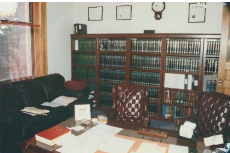
This was my Sanctum sanctorum