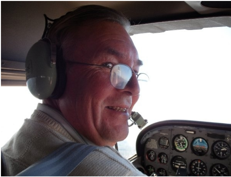
Flying to the FBI laboratory in Washington, DC with evidence to be examined of a Hit & Run Homicide, August 31, 1988