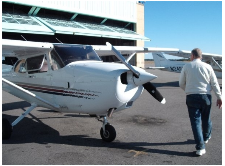
Another Pre-Flight for a trip to New Hampshire to investigate a Leaving the Scene accident involving a tractor Trailer, July 15, 1989