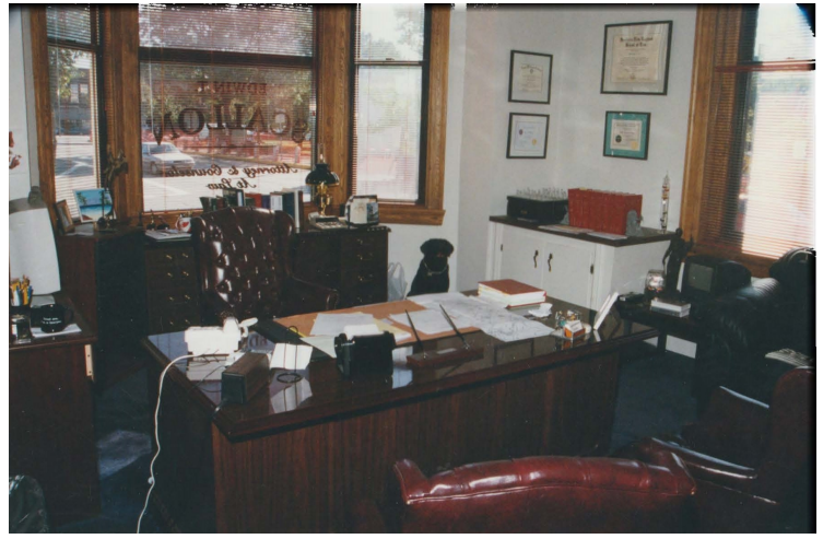
After passing three Bar Exams in three different jurisdictions I opened an office - this was my view of the world at that time