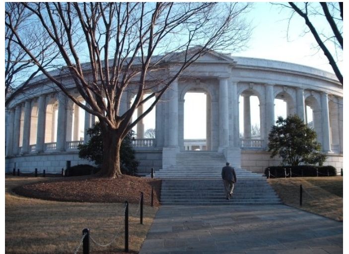
After my last Appellate case which I tried in Washington, DC I Visited Arlington