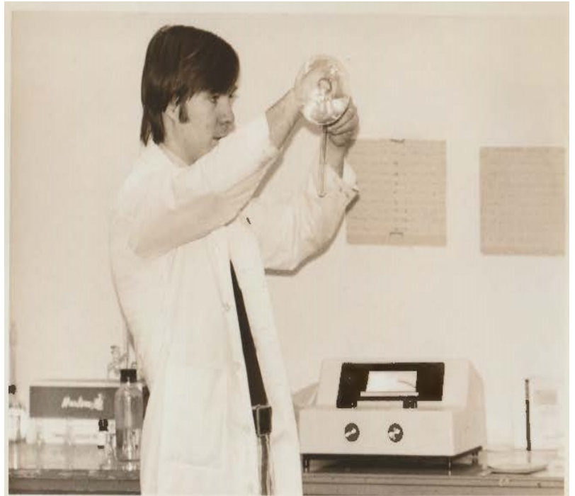
Well after college I began a research laboratory developed a Heartworm ( Dirofilaria ) test for dogs called the Swinex Test