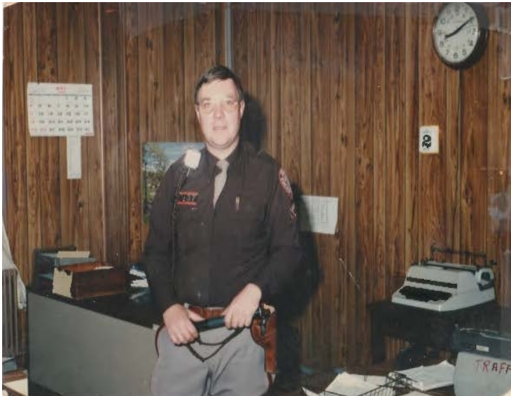
Became a Providence Police Officer and was assigned to the Traffic Division where I rode a Harley - Davidson