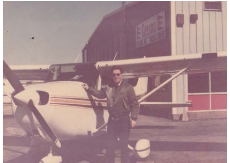
Pre-flight aircraft before I conducted a PPD photo recon On November 12, 1986